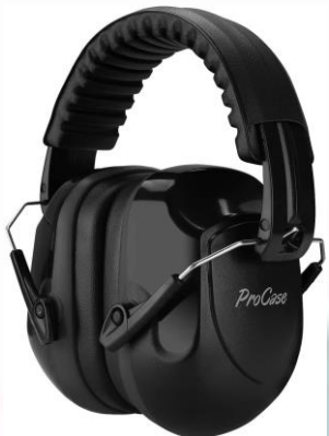
Noise reduction headphones