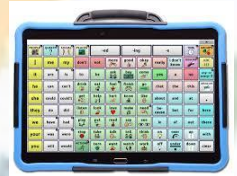
Dedicated speech devices