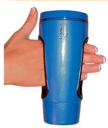
Easy Grip Mugs/utensils