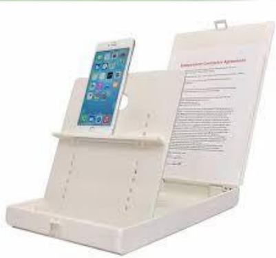
Mounts and holders