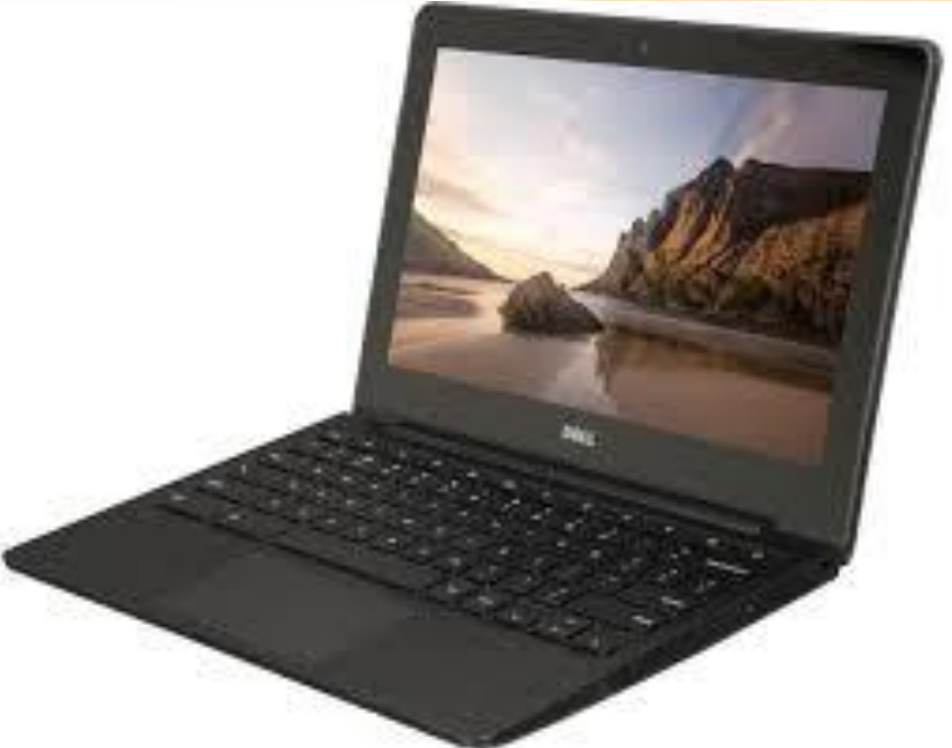
Chromebook laptop computers