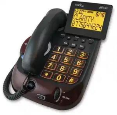
Specialized home phones